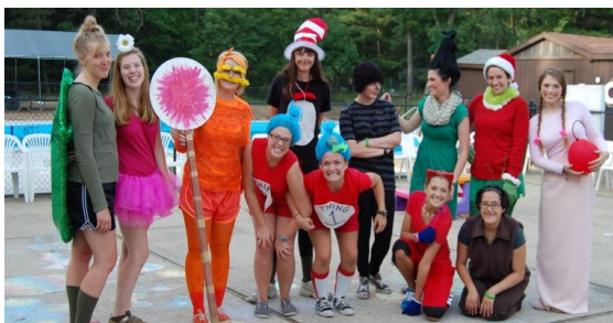
Staff-led themed program for kids

There are also age-appropriate Outpost opportunities available, such as riding at the Diamond O Ranch, a Challenging Outdoor Personal Experience, Climbing, and Sailing.